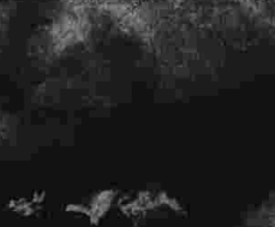
This is how things looked from the air as a forest fire, driven by a 35-mile wind, swept through exclusive Strat Rock, Mass., summer colony destroying nearly 500 fine homes with all furnishings. Here are more than 50 homes in flames. So intense was the heat that firemen and volunteers were able to make only feeble efforts to check the swift advance. The photographer, flying 1,000 feet above the fire, was hampered so by the heat that he was forced to turn away immediately after each exposure.